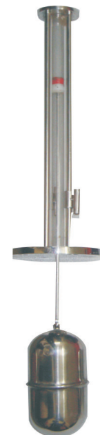
Model : CLI4-S SS Indicator with switching sensors